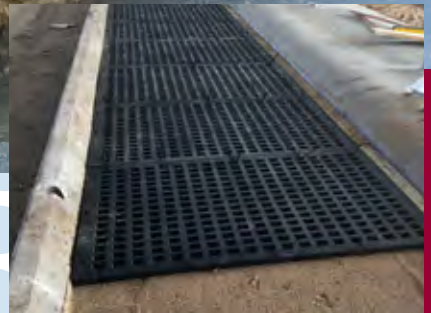
Studies show a level bed increases cow comfort and milk yield.