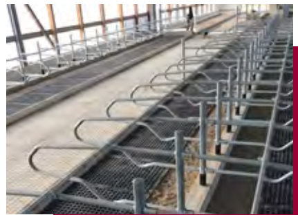
Agri-Grid Sand Saver mats can be used in all types of free stalls.

To learn more about Agri-Grid Sand Saver and other Comfort Mat Products, call us toll-free at