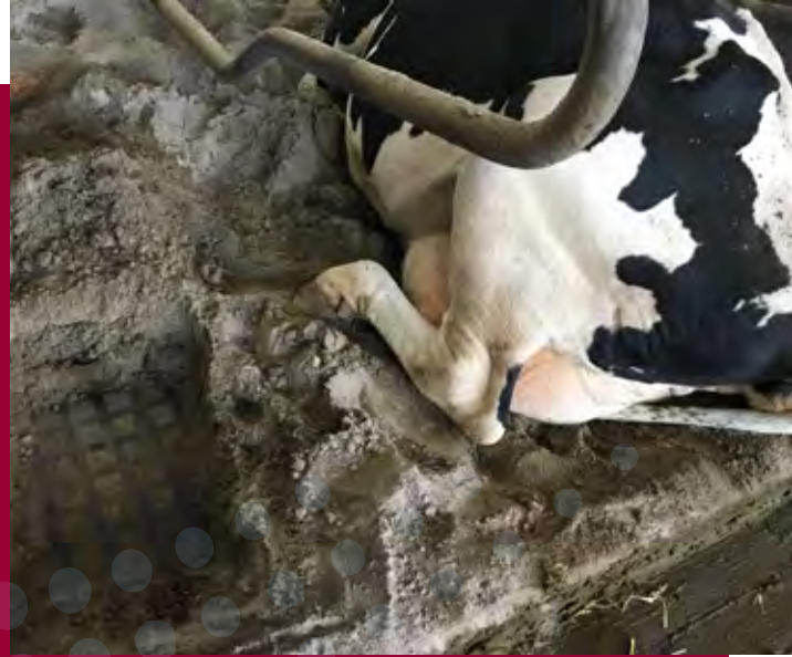
Our Agri-Grid Sand Saver mats are made with virgin tire rubber compound. This gives our mats higher durability and stability.